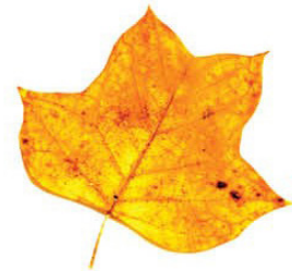
Tulip Tree ( Liriodendron tulipifera )