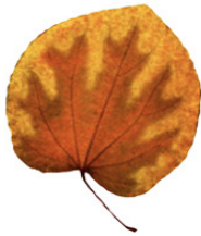
Katsura ( Cercidiphyllum japonicum )