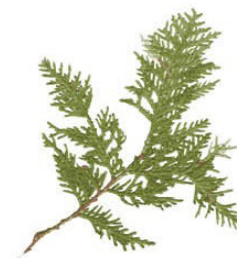
Western Redcedar ( Thuja plicata )