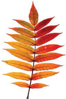
Sumac ( Rhus typhina )