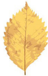
Camperdown Elm ( Ulmus 'Camperdownii' )