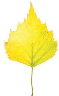
Himalayan Birch ( Betula Jacquemontii )

*Please remember to look, but don't pick leaves from trees or remove them from the gardens.