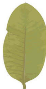
Magnolia ( Magnolia grandiflora )