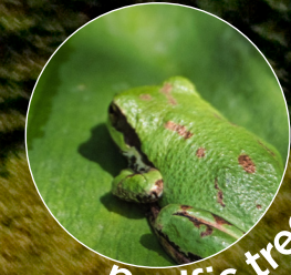
Pacific tree frog