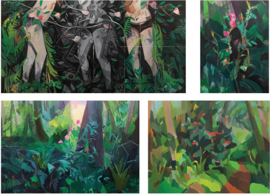
Clockwise from top left: Camellia Walk III (Green) , 2020; Camellias in the Forest , 2020; Camellia Walk I , 2020; Light in the Forest (Annunciation) , 2020