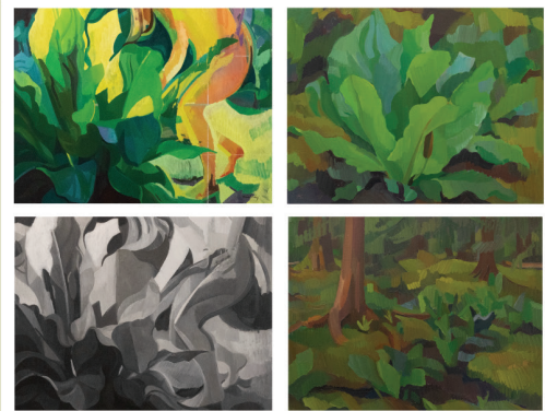
Clockwise from top left: Nymph & Skunk Cabbage , 2020; Skunk Cabbage , 2018; Moss Garden , 2018; Nymph & Skunk Cabbage (Tonal) , 2020