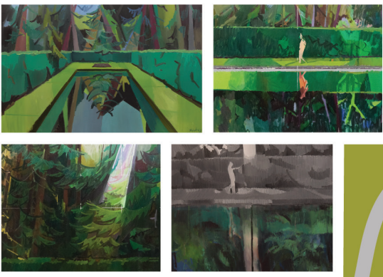
Clockwise from top left: Reflecting Pond , 2019; Reflecting Pond (Persephone II) , 2020; Reflecting Pond (Tonal) , 2018; Light in the Cedars (Annunciation) , 2020